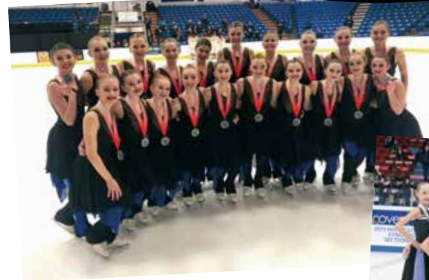
Capital Ice Chips National Pewter Medalists