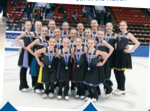
Capital Ice Connection 6th in the Nation

CORPORATE SPONSORSHIP TUESDAY, AUGUST 13, 2019, 6:00 PM Raging Rivers, 2600 46th Ave. SE, Mandan, ND