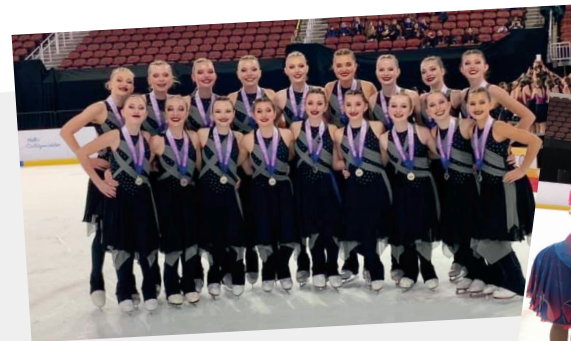
Capital Ice Chips National Silver Medalists