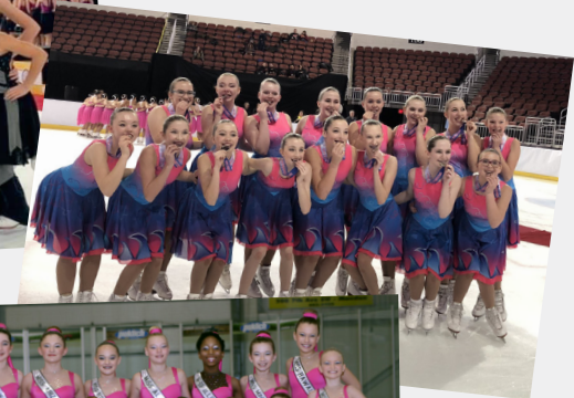
Capital Ice Chill Sectional Silver Medalists