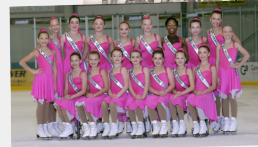
Capital Ice Connection Gold Medalists Maplewood Synchro Classic