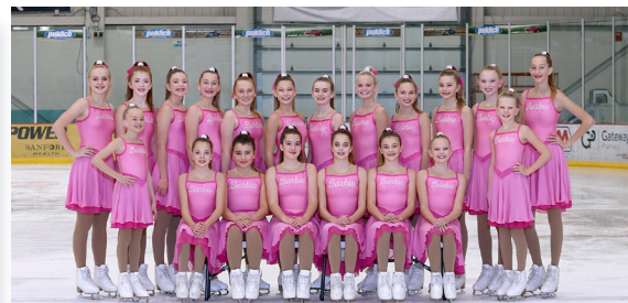
Capital Ice Connection