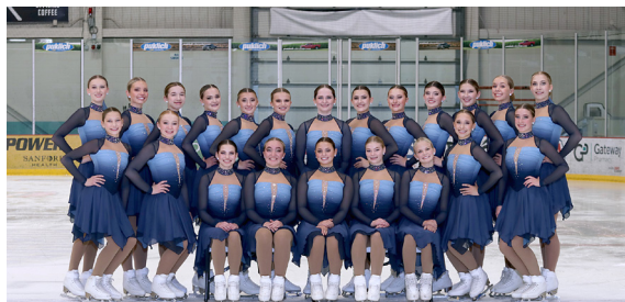
Capital Ice Chips 2023 National Champions

These 135+ dedicated skaters are grateful for each and every sponsor.